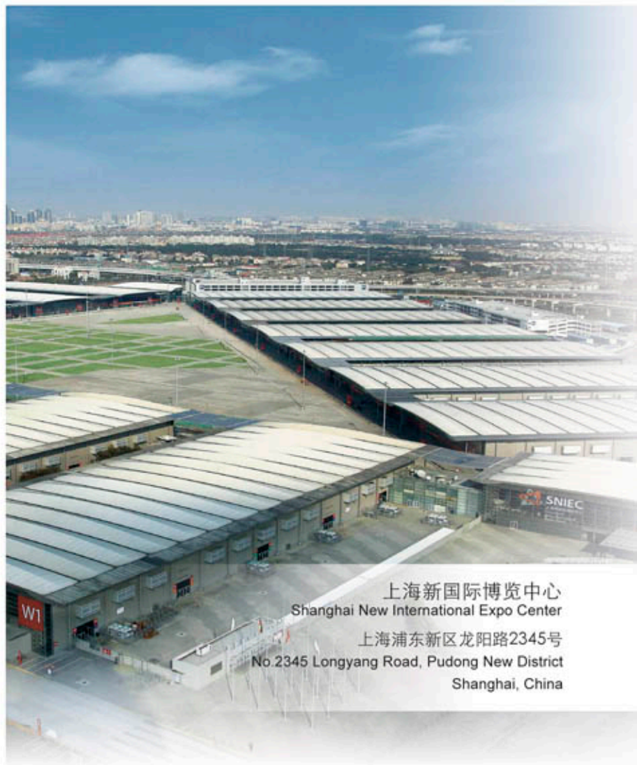
上海新国际博览中心 Shanghai New International Expo Center 上海浦东新区龙阳路2345号 No 2345 Longyang Road, Pudong New District Shanghai, China

The whole SNIEC team is 100 percent committed to make your show the leading one in your industry! We look forward to serving your exhibitions, events and clients. We understand your needs, come and challenge us.